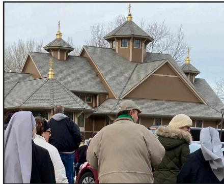
Pilgrimage to Immaculate Conception Church

On Ash Wednesday, a Mass was offered for the people of Ukraine as well as prayers on the loud speaker every three hours. The Knights of Columbus established a fund to help the people of Ukraine, that matched any donations up to $500,000. Our Residents spent the day in the lobby watching with gratitude as the monetary donations poured in from our Residents, staff