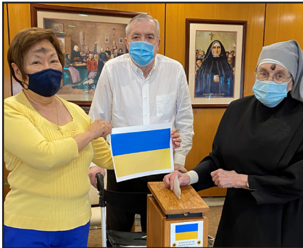
Ash Wednesday Collection

Together with our Residents, we have been following the horrible events in Ukraine which began with the Russia's invasion on February 24. Although it was tempting to sit back and feel helpless, we heeded the call of our Holy Father to unite with the faithful all over the world and pray.