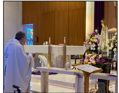
Praying the Consecration Prayer to Mary

It has been especially difficult for our friends at the Ukrainian Byzantine Catholic Church not far from our Home. On Thursday, March 3rd, our bus was ready for a group of apartment Residents while five Little Sisters set out for St Theresa's Parish on foot for a prayer service and the start of a 2 ½ mile 'prayer pilgrimage of peace' to Immaculate Conception parish. With a full crowd, the service began as the bishop and priests of the Ukrainian Rite processed to the sanctuary with our priests from St Theresa's and several