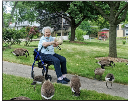
A Peaceful Summer Afternoon

Since our weekly COVID testing began in May, we are happy to report that none of our Residents or Little Sisters have been infected with the virus. The Illinois Department of Public Health (IDPH) has issued guidelines and our strict adherence to infection control has paid off. With IDPH's approval, after months of Residents sheltering-in-place in their rooms, they are allowed to go outside.