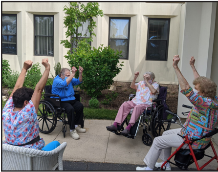
Outside Group Exercise

Since our weekly COVID testing began in May, we are happy to report that none of our Residents or Little Sisters have been infected with the virus. The Illinois Department of Public Health (IDPH) has issued guidelines and our strict adherence to infection control has paid off. With IDPH's approval, after months of Residents sheltering-in-place in their rooms, they are allowed to go outside.