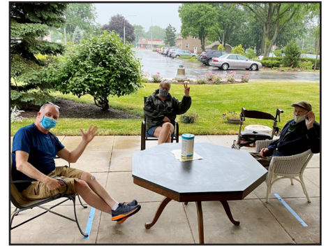
Welcoming our Families Back!

Group exercising now takes place outside, and the fresh air actually helps us to work harder. IDPH has