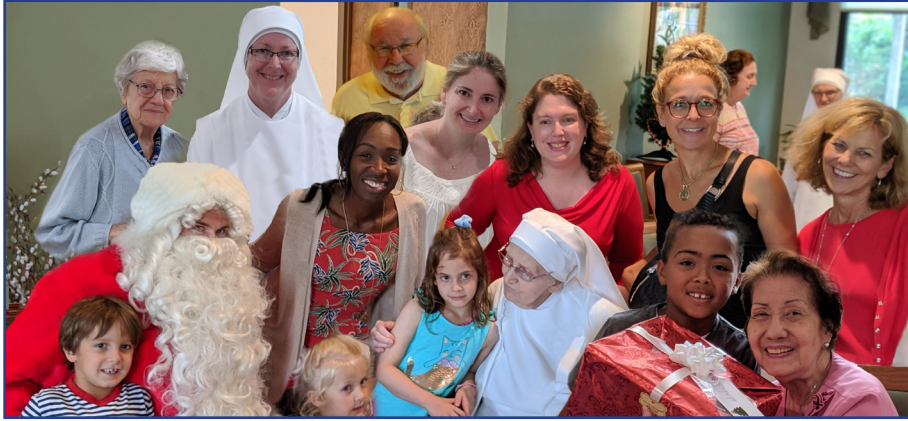
Santa and his many helpers worked hard to make this a special day for us. Our heartfelt thanks to St. Isaac Jogues' CCW who organized a beautiful 'Christmas in July' celebration.