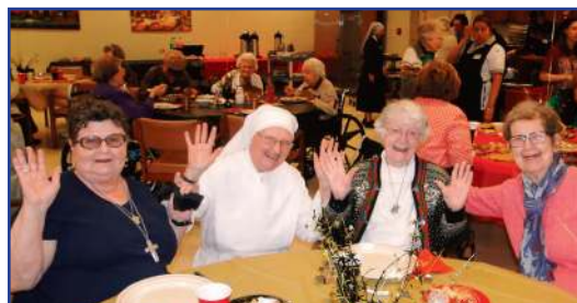
Your support enables us to provide a loving Home with quality care for the needy elderly.

Thank you for making a difference in the lives of the needy elderly.