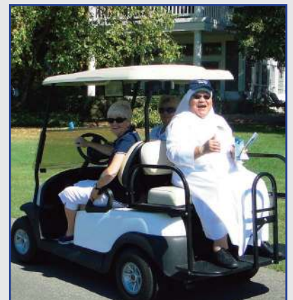
Swing and a Prayer Golf Outing is Monday, September 10th, at Wynstone Golf Club in North Barrington.